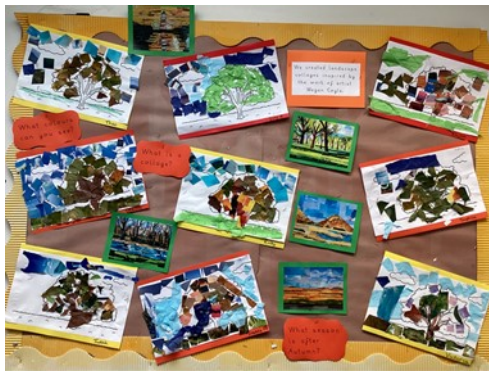
Leaf man pictures

Garnet class has been learning about autumn and has created some lovely art and writing.